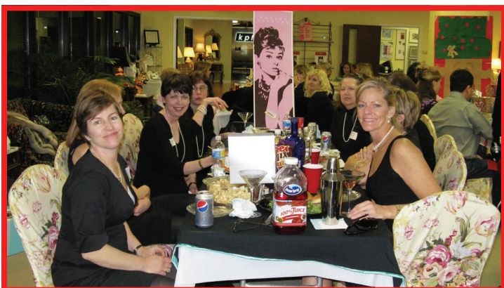
2nd Annual JLSL Trivia Night