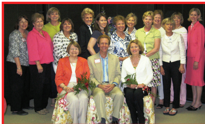
Drue Lane Webster Volunteer Service Award